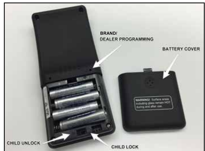
Figure 1. Install Batteries & Child Safety